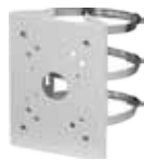
PFA150 Pole mount