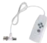
PFM820 UTC Controller